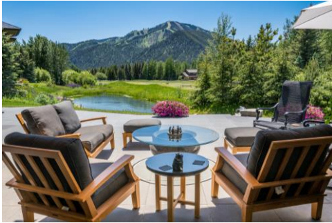
195 S Bigwood Dr, Ketchum $12,698,000