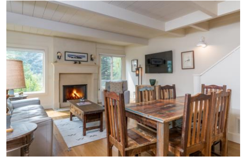
1233 Villager Condo Dr, Sun Valley $1,450,000