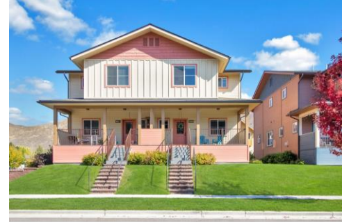
2452 Shenandoah, Hailey $695,000