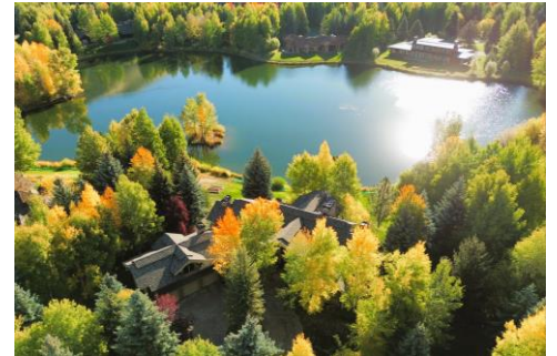
140 Eagle Lake, Golden Eagle $6,495,000