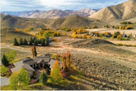
101 Coeur d'Alene, Indian Creek $2,700,000