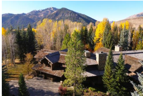
600 Northwood Way, Ketchum $9,950,000