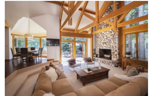
321 Georginia Rd 2, Warm Springs $3,500,000