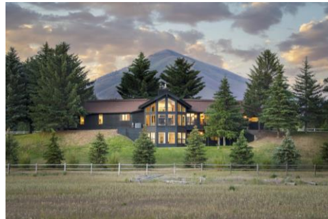
106 Chestnut Lane, Bellevue $2,475,000