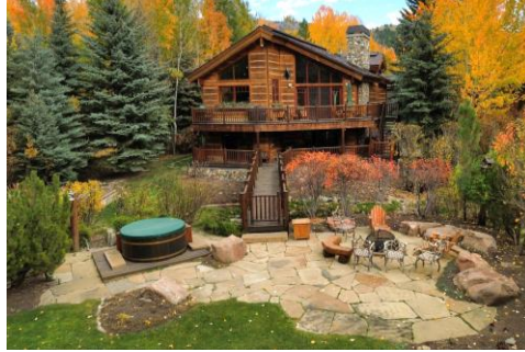
225 Eagle Creek, North of Ketchum $5,995,000