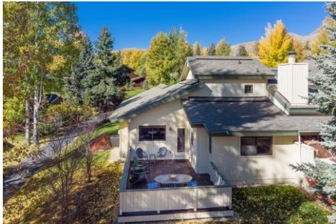
106 Dandelion East, Elkhorn $1,695,000