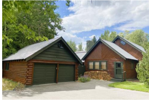
12694 State Hwy 75, S of Ketchum $3,150,000